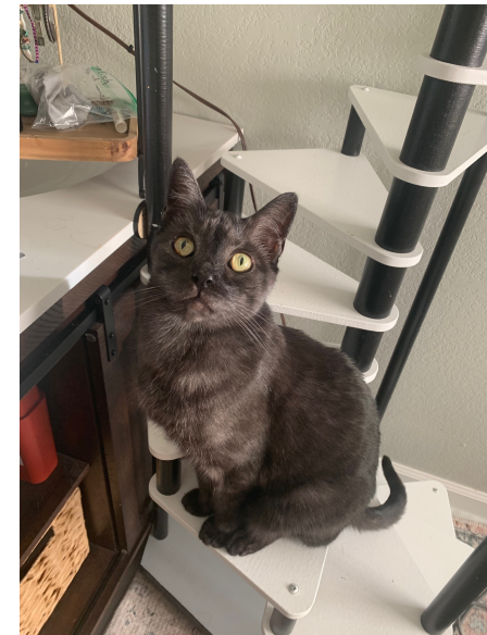
Silas – 12yr old domestic short hair