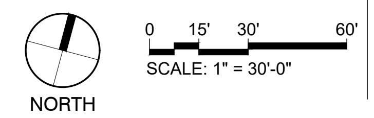
1 LANDSCAPE PLANTING PLAN SOUTH 1" = 30'-0"

PLOT DATE: 8/5/2022 10:18:33 AM 7/27/2022 2:32:55 PM C:\Temp\ARCH\PHB-ConeShel_samm_howard.rvt