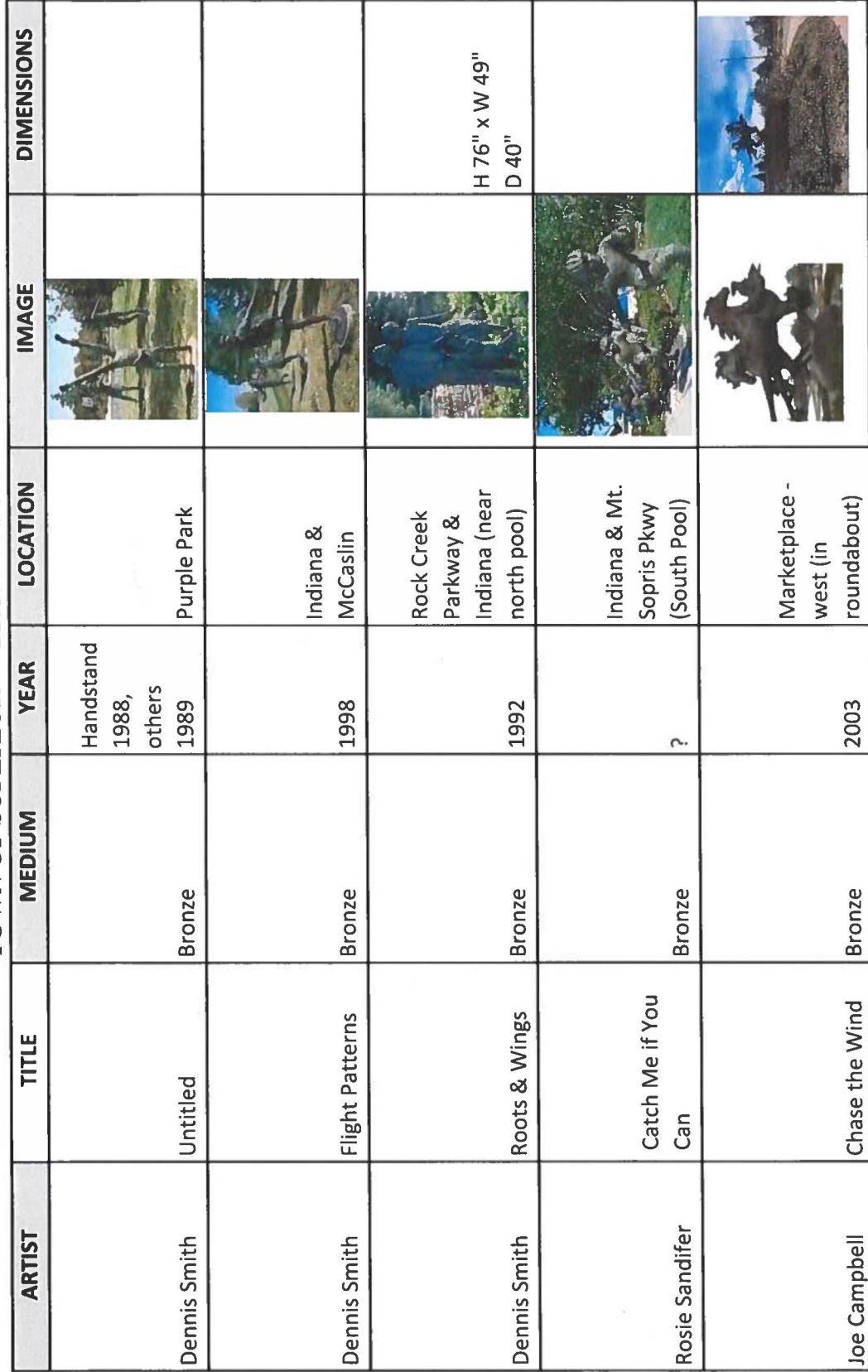
EXHIBIT B TOWN OF SUPERIOR — BRONZE COLLECTION