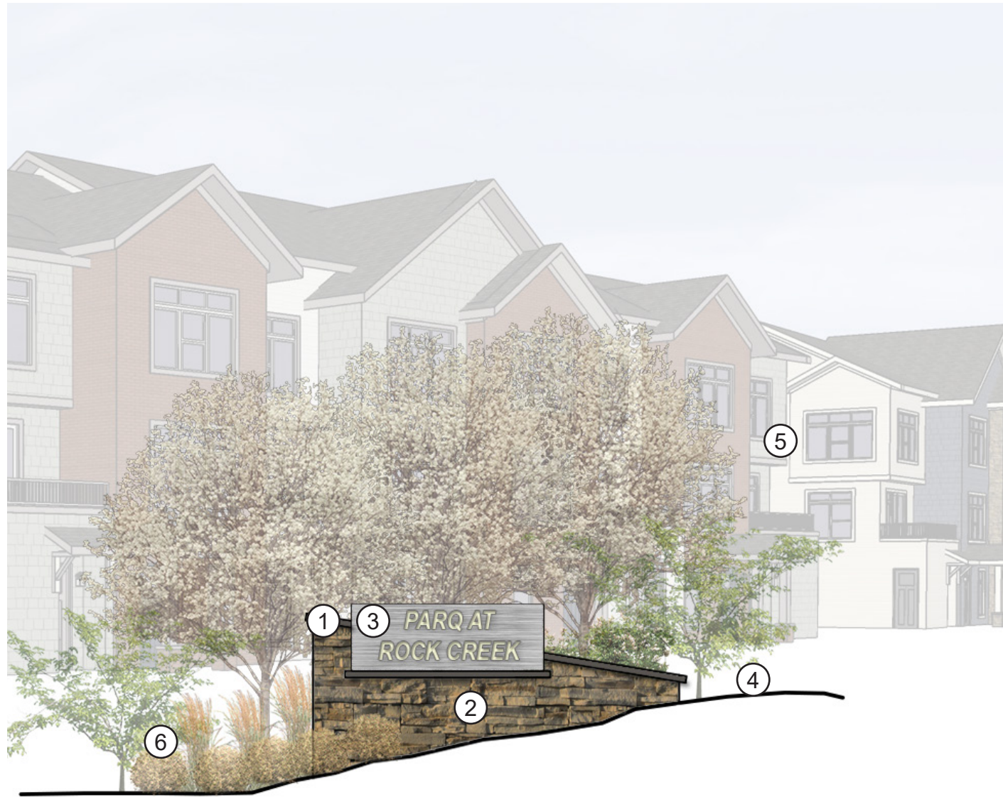
MINOR MONUMENT - NORTH ENTRANCE FACING SOUTH - ELEVATION SCALE: 3/16" = 1'-0"