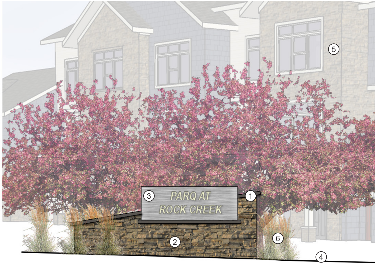
MAJOR MONUMENT - SOUTH ENTRANCE FACING NORTH - ELEVATION